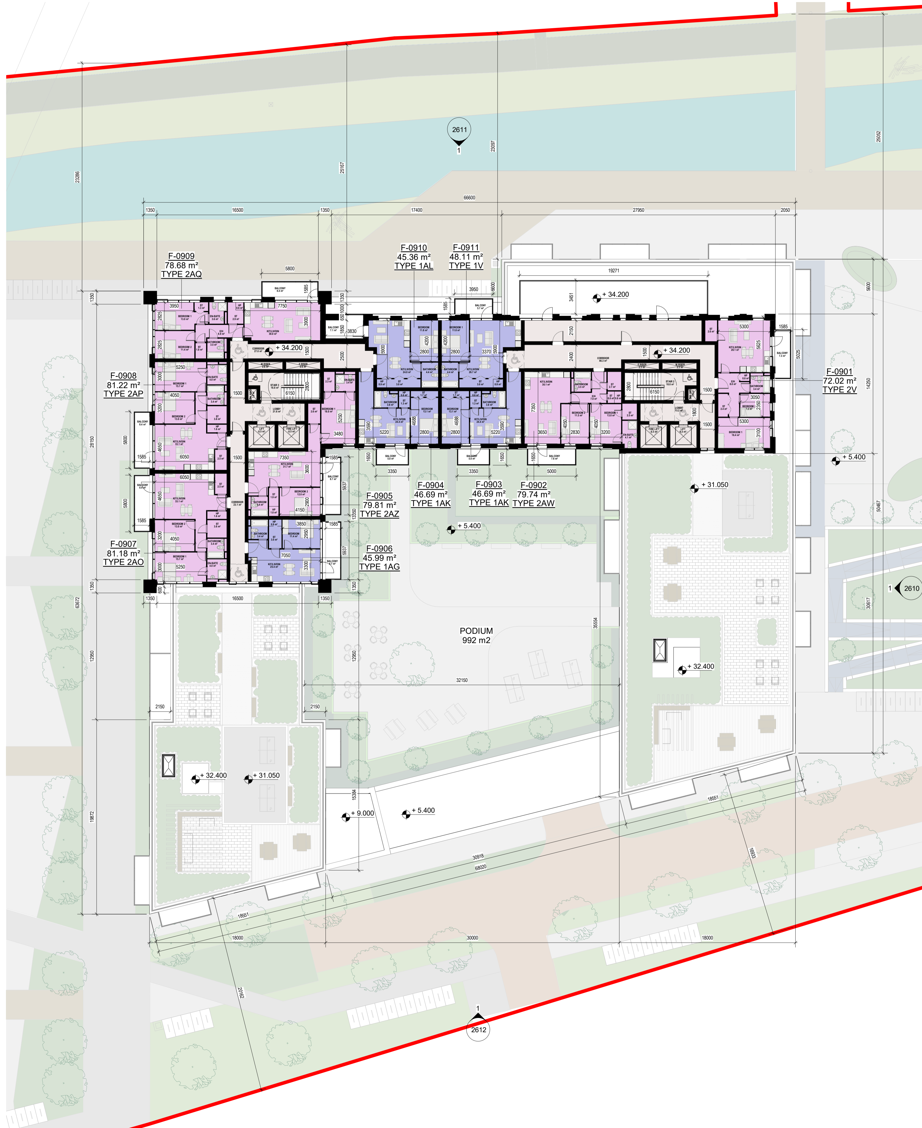
1 PLAN - BLOCK F - LEVEL 09

Please consider the environment before printing this sheet